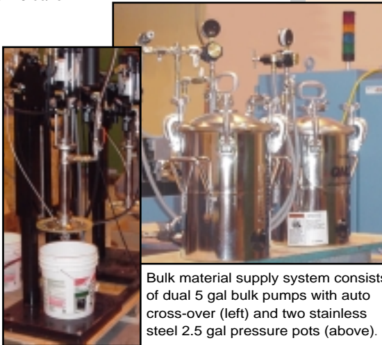
Bulk material supply system consists of dual 5 gal bulk pumps with auto cross-over (left) and two stainless steel 2.5 gal pressure pots (above).