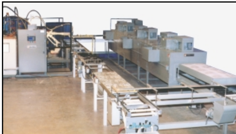
A typical automated assembly system configuration