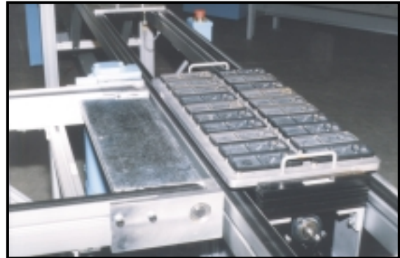
A Powered End Transfer (above) and Corner Transfer (below) in action

Pallet Stops: Pallet stops have pneumatic cylinder design with a rubber bumper stop; stops pause pallets at specific locations in the assembly line to control pallet flow