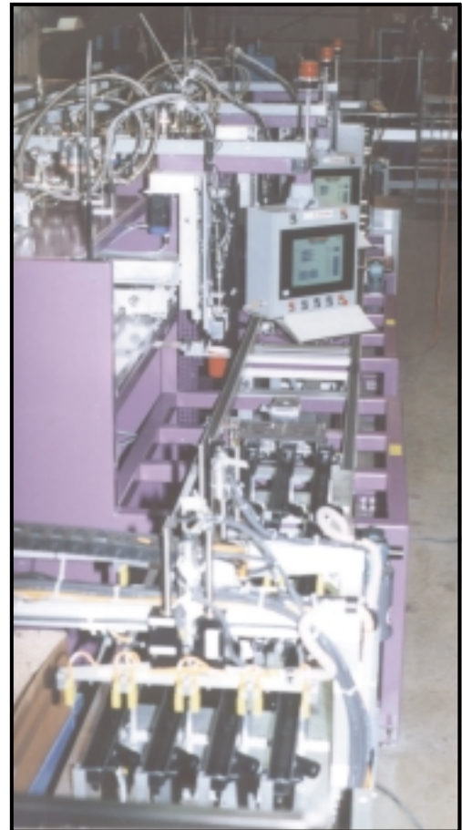
Dispensing stations as part of an automated assembly system: A 5-axis dispensing robot (left) and dispensing and inspection stations (right)